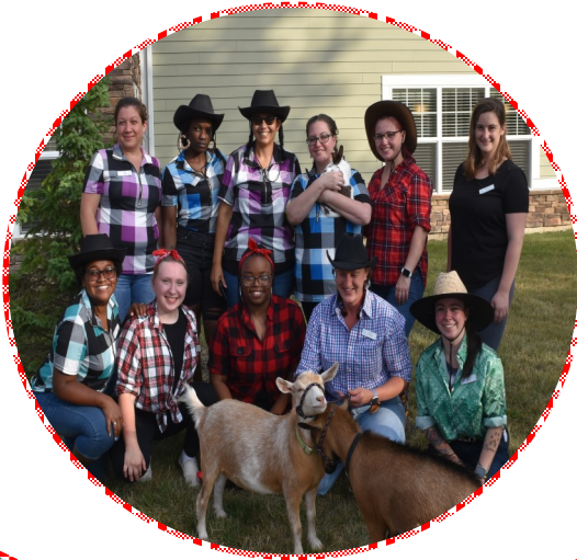
Foodtastic Culinary Team!