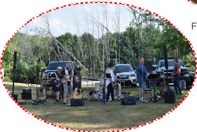
Fantastic music with Dark Horse Run