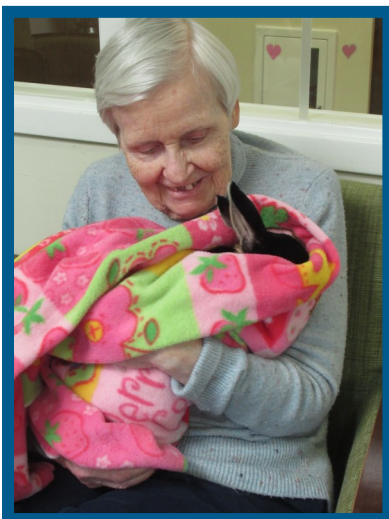
We had a nice visit from Moo the bunny this month. He was the perfect size for cuddling!